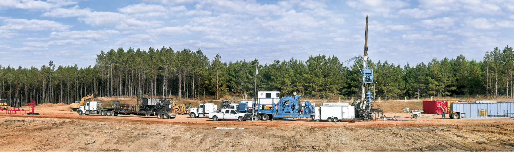
Work pregresses at a $34 million Department of Energy funded research project evalutaing sequestration and monitoring strategies for long-term storage of carbon dioxide at Cranfield field in Mississippi. Here, an observation well is being drilled and fiberglass casing is waiting to be inserted and cemented inside the well.

above zone gauge first," says Meckel. Beginning prior to injection in 2008 and operating continuously through to the present, the above zone monitoring at Cranfield represents the longest continuous data series for any CO<sub>2</sub> injection site.